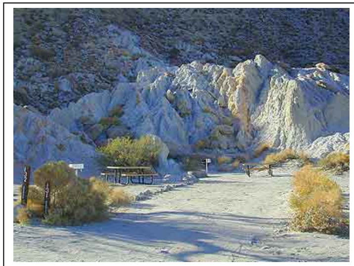
NICE TABLES AND FIRE RINGS